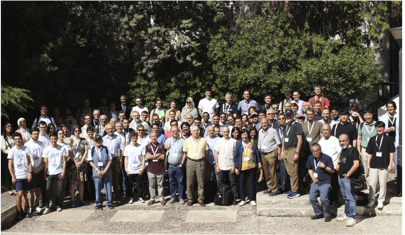
Figure 1: Group photo of OPSFA–17 in Granada, Spain.

posters. We would like to highlight that, thanks to the support of IMAG at the University of Granada , 15 scholarships for full-board accommodation were awarded to students who participated in the conference and 25 reduced fee grants for students and people from developing countries.