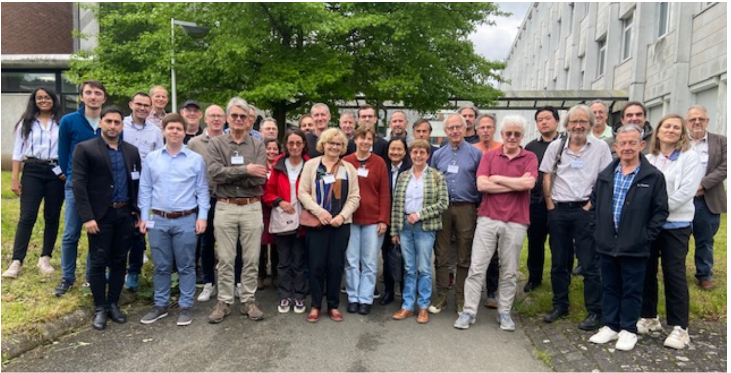
Figure 5: Group photo at Journées Approximation, Lille, France, 15–17 May 2024.