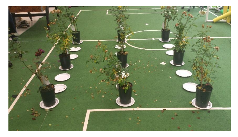
Figure 2: Rose Field, each white plate represents a node which the YouBot is not allowed to go to.

Second, a sufficient rose field is required. Potted roses were arranged in rows of three as displayed in figure. The roses are 17.5 by 17.5 cm and placed along each other by a distance of approximately 20 cm. Each row has a distance of approximately .75 m to the next. Since the test environment contains three rows of roses, YouBot is required to drive through its 5 "lanes".