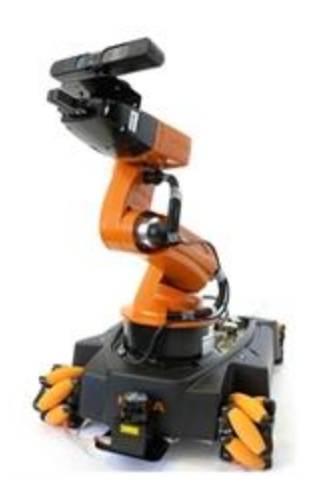
Figure 1: Kuka youBot equipped with Asus Xtion Pro Live camera, Xsens MTi-G-700 sensor and Hokuyo LX30 laserscanner

A KUKA YouBot with the following specifications was used for this project: