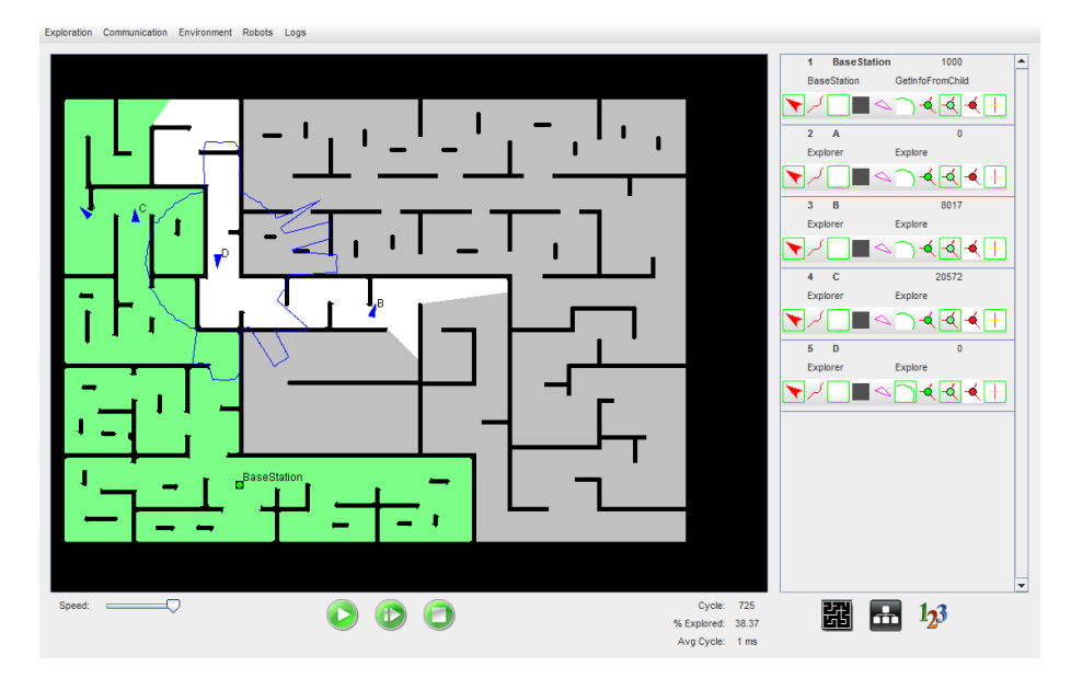
Fig. 1. Screenshot of MRESim. Obstacles are shown in black (-), unexplored area is shown in grey (-), area known at base station is shown in green (-). The blue arrows (-) represent exploring robots, and the communication range of robot D is shown as the blue polygon (-).

Algorithm 2: Description of the agent takeStep method