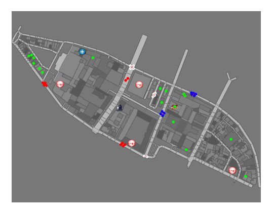
Figure 1: Initial configuration for the Paris-mini-hard map.

An example of such initial configuration of such map, showing the topology, initial fires and agent positions are shown in Figure 1, where one can recognize the Île de la Cité with the Notre Dame de Paris in the lower middle.