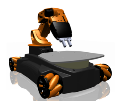
Fig. 3. Impression of the KUKA youBot

The Universiteit van Amsterdam participates in the KUKA Innovation in Mobile Manipulation Award and in the RoCKIn competition with a KUKA youBot [14]. The KUKA youBot consist of an omnidirectional mobile platform with a small robot arm mounted on top of the platform. The platform has omnidirectional capabilities thanks to Swedish wheels; wheels with rollers mounted under an angle of 45°. This concept is not introduced before in USARSim, which implies that the KUKA youBot model could be the predecessor of a whole family of omnidirectional robots.