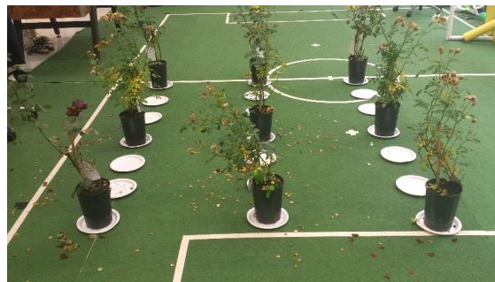
Figure 2: The setup used for the project 'Navigating youBot through a rose field with A*'.

As the accessible terrain may change when plants are removed, added or relocated, an internal map representation must dynamically be updated when the robots moves. Because the location of the desired plant is not (exactly) known at the start of the search, some kind of greedy mapping could be used. As soon as the plant is found and picked up though, pathplanning can be used to calculate the most efficient way back to the robot's initial position (and thus the customer). As still the map may have changed during the pickup, even the pathplanning should be dynamical as well. In order to implement this, a first version of D*-Lite [3] was developed and tested. As for now, it is assumed that the configuration of the setup does not change so that path planning can be carried out by basic A* (illustrated in Fig. 2). The full details of this approach can be read in the project report [2].