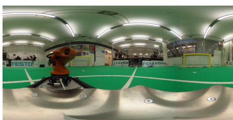
Figure 4: Image captured with a Ricoh Theta from the KUKA youBot.

When mounted on moving platform, both the disappearing points are visible (which indicated the direction of movement) and a ring of maximal optimal flow, which can be used to estimate the amplitude of the movement. Currently the orientation can already accurately estimated from the optical flow, an accurate estimation of the translation is under study.