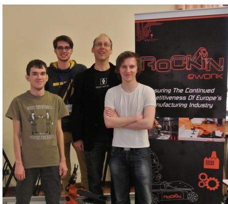
Figure 5: Image captured with a Ricoh Theta from the KUKA youBot.

problems, but how to structure the solution in the most effective and elegant manner. Therefore he has taken the role of software architect upon him, investigating and realizing a dedicated framework for the team to use.