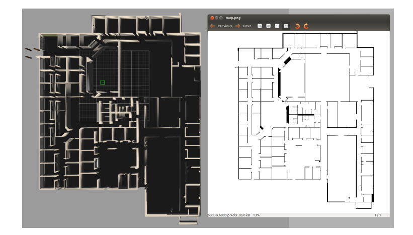
Fig. 3. Screenshot of 3D environment (left) and it's ground truth information (right). Ground truth information is used to calculate received Wi-Fi radio wave power strength between Wi-Fi base station and a robot or between multiple robots

This could be continued with experiments on slopes and trajectories over obstacles. The NIST institute has made a very useful test-document for Rescue Robots, with a wide variety of experiments which could be performed [9].