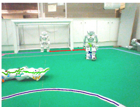
Figure 2: Cluster assignment algorithm