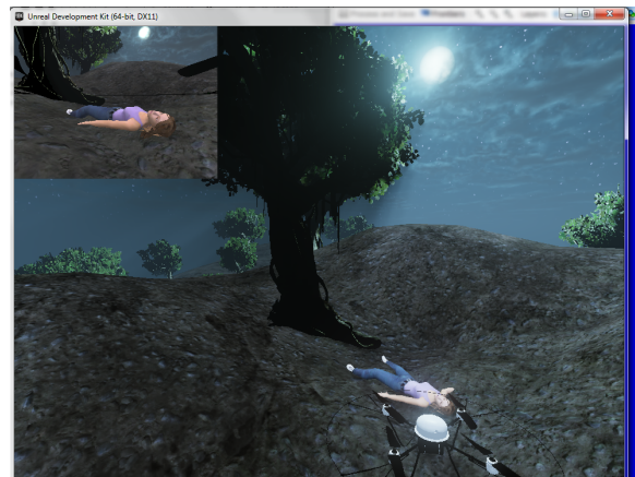
Figure 4: Outdoor scenario for the Virtual Robot competition in the Dutch Open Final 2012.

The shared map generated during the competition has a central role in the coordination of such large robot teams. This is where the sensor information selected to be broadcasted via often unreliable communication links is collected and registered. The registration process is asynchronous; some information may arrive at the base-station even minutes after the actual observation. There is no guarantee that the operator has time to look at this information directly, which implies that the map within the user interface has to be interactive and should allow the operator to call back observations that were made at any point of interest (independent of when the observation was made and by which robot). At the same time the registration process should keep the map clean (no false positives or wrong associations), because it is the area where the coordination of the team behaviors is done.