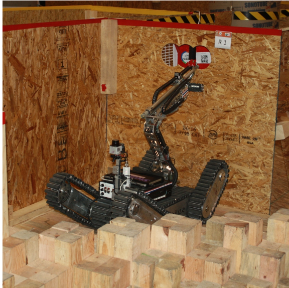
Figure 1: Rescue robot of team Stablize from Thailand inspects a simulated victim near a step field at the RoboCup 2012.

generated by the robot online. The signs of life can be the visual appearance and movements of the victims, simulated body heat, CO 2 levels, and audio signals. The harsh terrain is built of different ramps, stairs, and so called “step fields”, which is a normed pattern of wooden blocks resembling the structure of a rubble pile (see Figure 1).