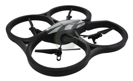
Figure 1: The Parrot AR Drone 1

For years and years unmanned aerial vehicles (UAVs) were only used by the military, mostly to enhance security. Now, UAVs are available for small research groups and even consumers. When Parrot started selling the AR Drone 1 for a price many households could afford, it became interesting to research the interaction between drones and humans. One can now foresee situations where a drone is a part of a normal household. The drone would assist its owner with his everyday persuits. For this to happen, a drone should be suited to be