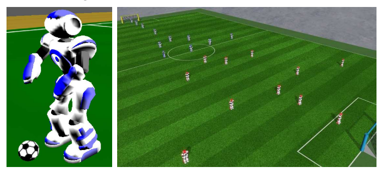
Figure 1. On the left is a screenshot of the Nao agent, and on the right a view of the soccer field during a 11 versus 11 game.