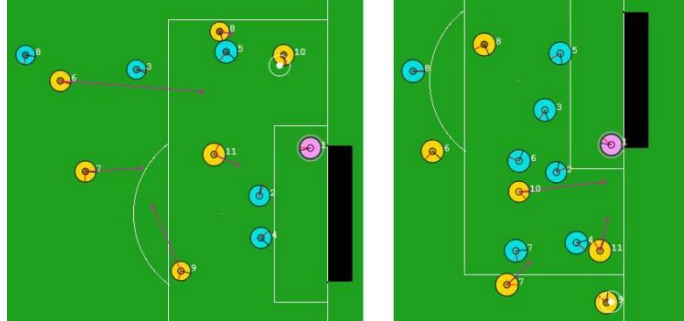
Fig. 3. FC-Perspolis's unmark system.