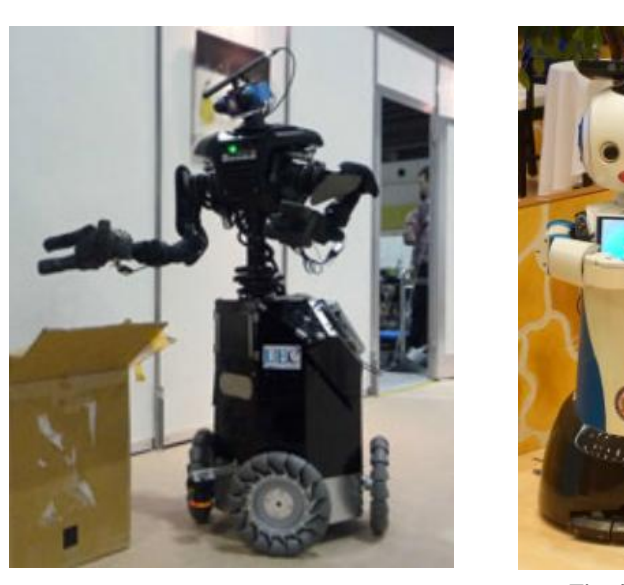
5 Reference Fig. 3. DiGORO

https://sites.google.com/site/erasers2050/photos-movies/