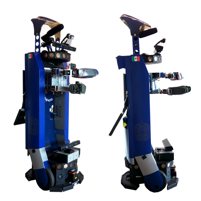
Fig. 2. The Golem-II+ robot.