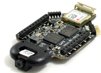
Figure 3: The AI-deck 1.1.