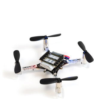
Figure 1: The Crazyflie 2.1 nano quadcopter.

The IMAV 2022 Nanocopter AI Challenge requires all participants to use identical hardware. This consists of the Crazyflie 2.1 nano quadcopter and the AI deck 1.1, both are produced by Bitcraze.