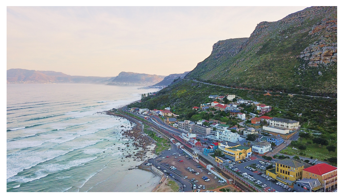
Muizenberg, South Africa

have been studied. For example, rational solutions and special function solutions of Painlevé equations have a close relationship with orthogonal polynomials. From a numerical perspective, reliable and efficient evaluation of solutions of Painlevé equations poses significant challenges, and several approaches have been proposed in the literature, including initial value and bound-ary value methods in the complex plane and numerical calculation based on the Riemann-Hilbert formulation. Presentations will include survey type lectures on important developments in the area as well as lectures on recent results and open problems.